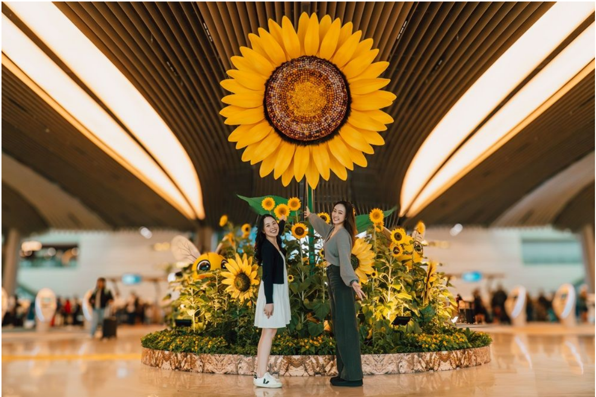
Five-metre-tall rotating sunflower topiary structure and floral display at Terminal 2 Departure Hall