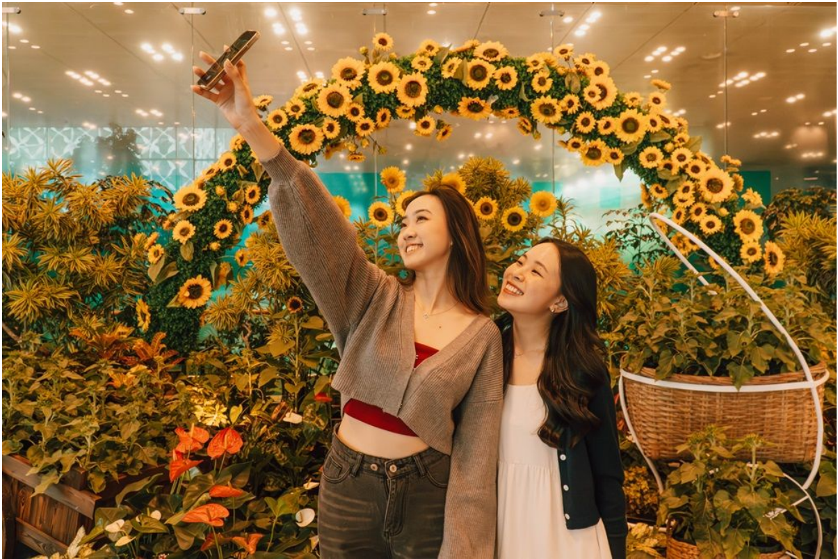
A luscious sunflower floral arch photo spot near the public Skytrain at Terminal 3 Departure Hall sets a tranquil garden mood

Additionally, visitors can delve into how sunflowers have inspired humans throughout history, impacting both art and agriculture.