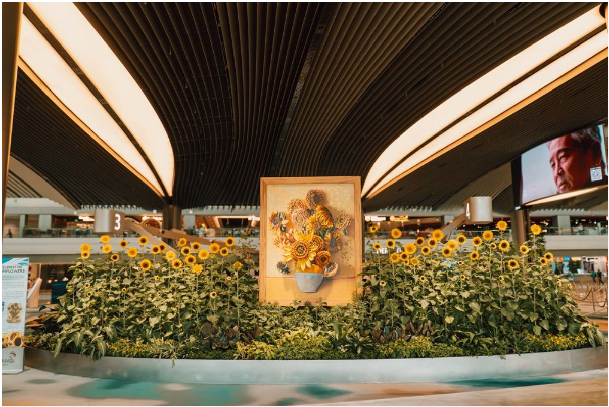
Spot a topiary sunflower painting display at Terminal 2 Departure North (Public), celebrating the iconic beauty and cultural significance of sunflowers